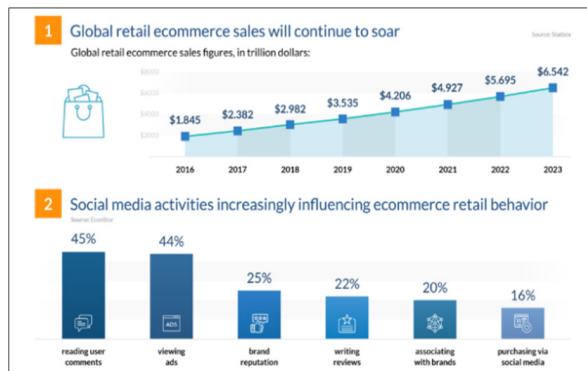
Fig. 2. Ecommerce Trends.

This study is conducted to analyse the effect of gender on online purchase behaviour of consumers [10, 11]. Despite the numerous researches on online purchasing behavior of customers, there is a gap in the research revealing the impact of gender on online buying behavior of consumers. So the main aim of the current study is to analyse if there is any significant influence of gender on online buying behavior of customers.